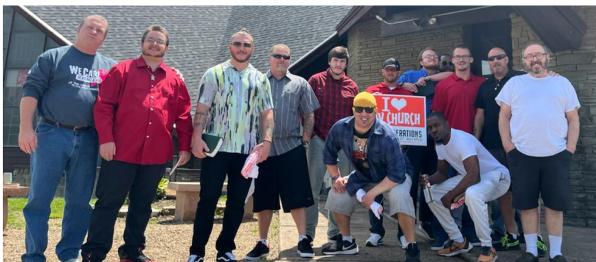
WPA visits Generations House of Worship Church in New Kensington, PA