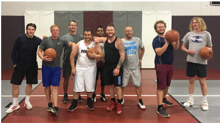
Every Monday night the students get to play basketball at Evangel Heights A/G in Sarver, PA.