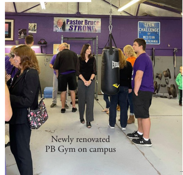
Newly renovated PB Gym on campus