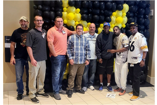
Students attend the MAN UP Conference at Victory Family Church