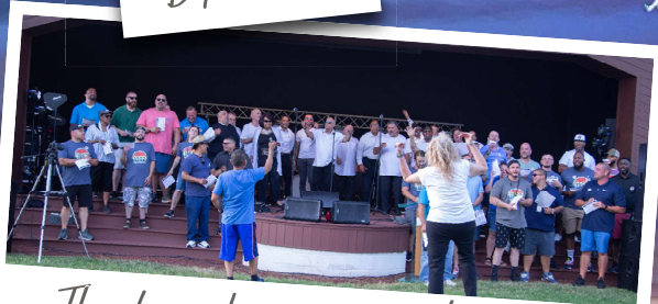
The alumni choir was amazing!