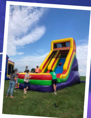
Fun for the kids